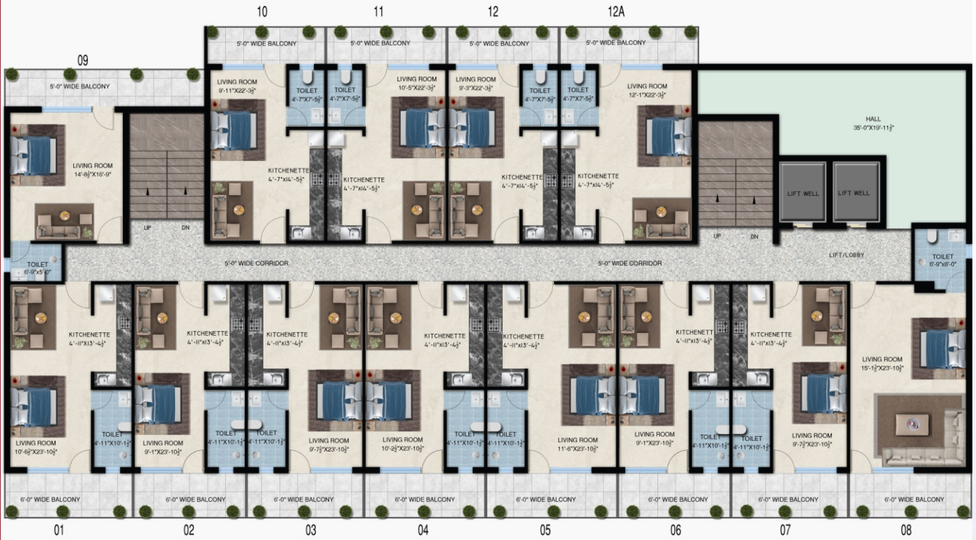
FOURTH AND FIFTH FLOOR